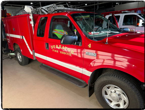
1999 Ford F-350 Rescue