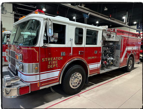
2000 Pierce Saber Pumper