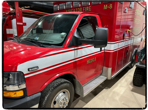
2022 Wheeled Coach