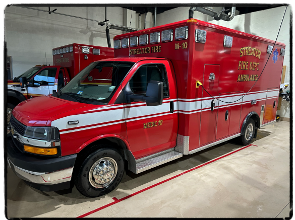
2022 Wheeled Coach