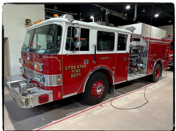
1989 Pierce Arrow Pumper