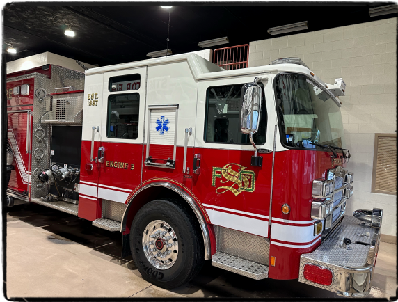
2018 Pierce Enforcer Pumper