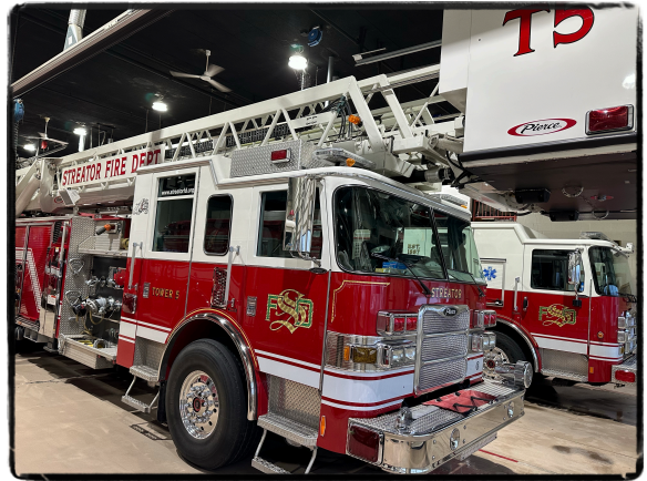
2008 Pierce ArrowXT 100' Tower